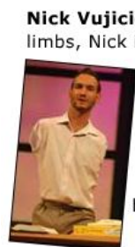
Nick Vujicic - born without any limbs, Nick is the founder of Life Without Limbs, a ministry that has a burning passion & fire to see more souls coming to the full knowledge of the hope & love of Jesus.

33 Miles - "We really believe that God has called us to the church. We feel like we've been called to remind the church and ourselves of who we are in Christ and whom we serve." This purpose is reflected in their name, a simple metaphor for the 33 years that Christ spent on Earth, and how He lived them.